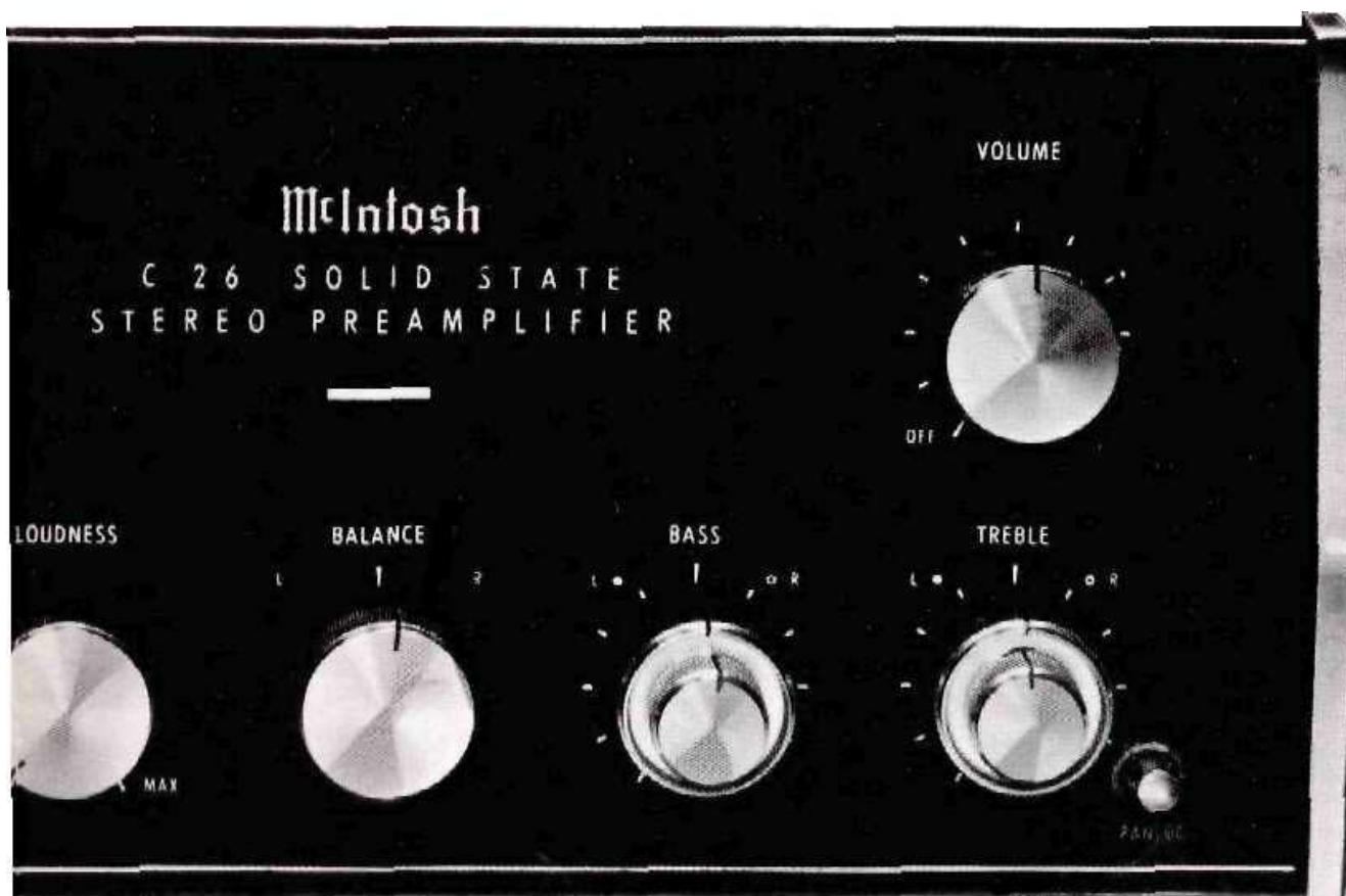
C 26 $349.00 -Cabinet $29.00

Added to these values is the complete protection from all service cost for three full years and you know why the McIntosh C 26 is the best value in a solid state preamplifier, anywhere. Only McIntosh offers a free THREE YEAR SERVICE CONTRACT with each piece of equipment! You can't pay us to service your C 26 for the first three years you own it. Both parts and labor are included in the contract.